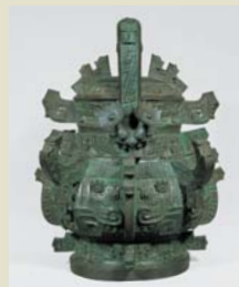
Wine Vase (you) with Phoenix Design, Nara National Museum