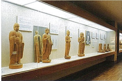
• Models of Buddhist sculptures and panel displays