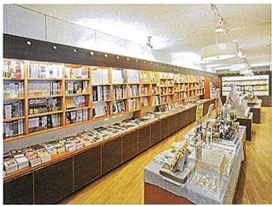
Basement Passageway (Admission free zone)